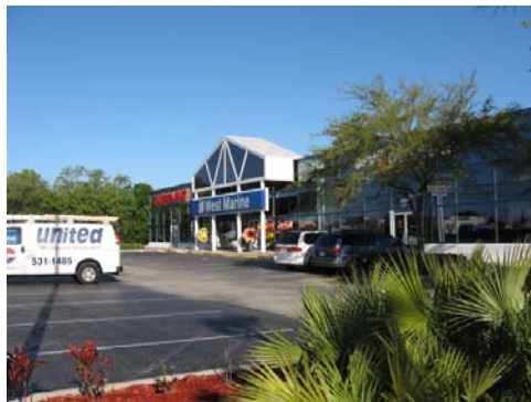
Front of center