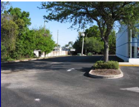
Western side of center