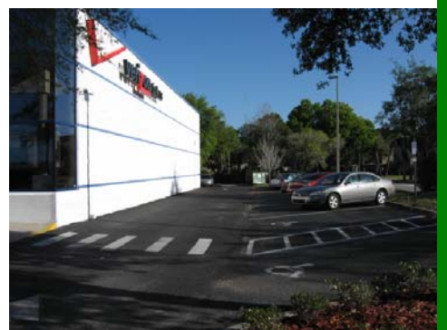
Eastern side of center